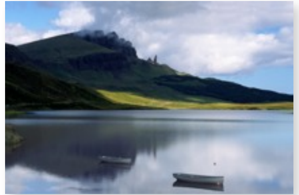
Eilean a' Cheo (formerly Isle of Skye)

In anticipation of May's Parliamentary Elections, the Highland Council voted to change the name of the Isle of Skye to a romanticized Gaelic title - "Eilean a' Cheo", [pronounced "ellan-uh-ch-yaw"] which means something like the "Misty Isle". (Some critics, however, say the actual Gaelic translation of the "Isle of Skye" is "an t-Eilean Sgiathanach".) This decision for the name change reflected the fact that 40% of the 9,000 residents on Skye are Gaelic speakers. Skye residents have mixed emotions about the change - some (mostly bed & breakfast owners) fear it could lead to confusion, while others welcome preservation of Gaelic cultural identity. (Article retrieved from the Scotsman website: http://news.scotsman.com/index.cfm?id=659562007 )