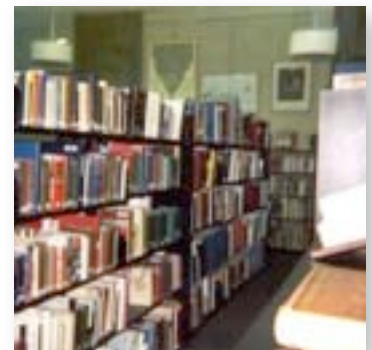
Part of Scottish Collection of the Odom Library

http://www.colquitt.k12.ga.us/public_lib/Genealogy/Repository/repository_index.htm