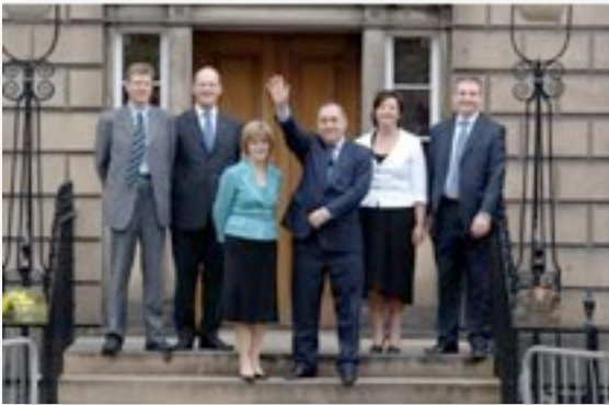
First Minister Alex Salmond with Cabinet Secretaries Kenny MacAskill, John Swinney, Nicola Sturgeon, Fiona Hyslop, and Richard Lochhead on the steps of Bute House